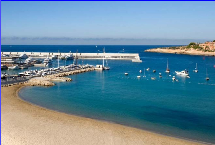
Port Adriano beach