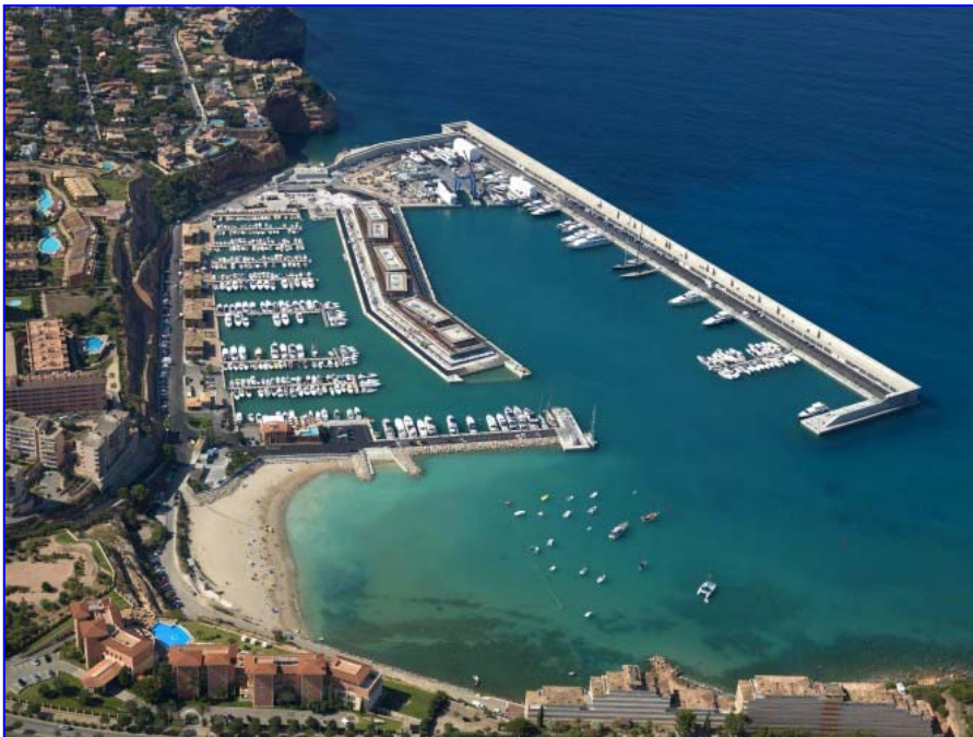
Port Adriano aerial view

For the fifth year running, Port Adriano attended Europe's largest show in the large yacht sector, the 2011 Monaco Yacht Show , which features the latest developments in vessels and services for super-yachts. 30 minutes by car from Palma de Mallorca , Port Adriano is one of the most select leisure ports on the Mediterranean, with a service area for moorings of 25,000 m 2 , 82 berths for super-yachts between 25 and 60/80m long. Port Adriano also has a 10,000m 2 technical area, with a dry dock suitable for large yachts, a 250-tonne Travel-Lift and boatyards equipped to deal with vessels of this size.