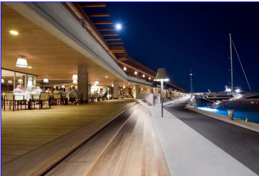
Port Adriano commercial area

attractions of the new marina. Prestigious Spanish and foreign sailing and fashion firms, restaurants and service companies will open to the public this summer.