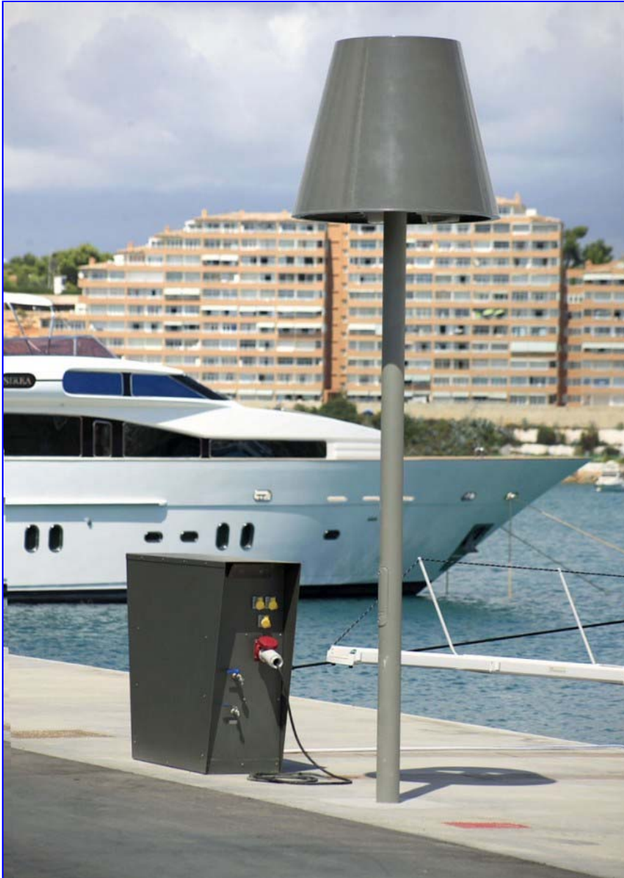
Port Adriano street lamp by Philippe Starck

Adriano Ice Cream , new home-made Ice-Cream Parlour, in the best Mallorcan style.