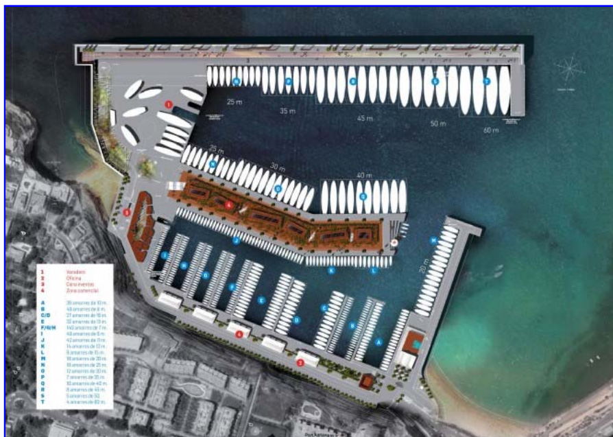
Port Adriano Moorings distribution

The new Port Adriano, a luxury meeting point Port Adriano has a service area for moorings of 25,000m2 and 82 berths for super-yachts between 25 and 60/80m long, located on the new dyke and counter-dyke, which makes Port Adriano one of the most select leisure ports on the Mediterranean, managed by a team of young professionals with considerable experience in marinas.