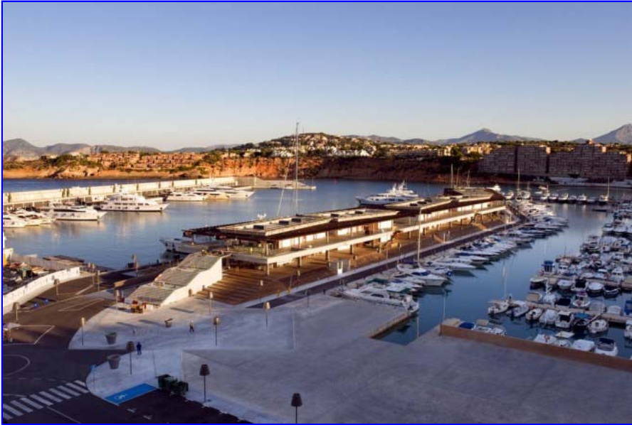
Port Adriano commercial area dyke

Fashion shop based in Germany, with a selection of the leading international brands of clothes for men and women. This will be its first shop in Spain.